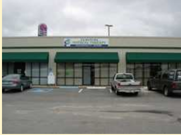
Clinton Physical Therapy 119 Ingram Street Clinton, AR 72031 501-745-8881